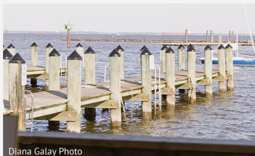
Diana Galay Photo