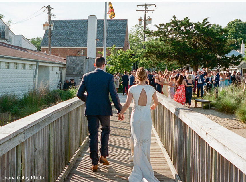
Diana Galay Photo

She offers an authentic setting perfect for up to 35 passengers for a bachelor(ette) party, rehearsal dinner, welcome party, brunch or an unforgettable addition to your guests' itinerary.