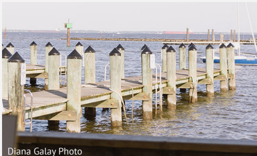
Diana Galay Photo