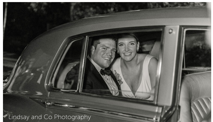
Lindsay and Co Photography

"The venue itself is absolutely beautiful, unique, and gives a feeling of a private hideaway, while still conveniently located in historic Annapolis. "