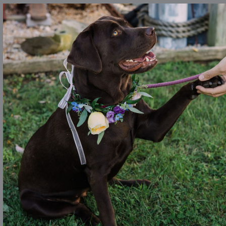
Laura's Focus Photography