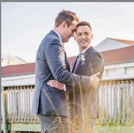
East Magnolia Photography

Stylish and boutique catering at a reasonable price. 410-944-4481 | zeffertandgold.com