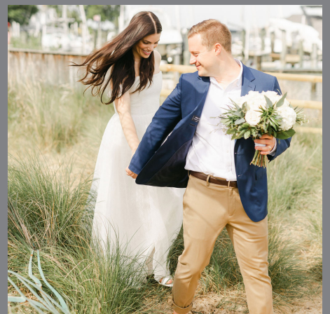
Lindsay and Co Photography

"All of our guests raved about how special and different the site was for a wedding. It offered multiple indoor and outdoor settings in one waterfront venue. Bonus perk -