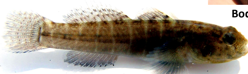
Body Length = 2 - 4 cm